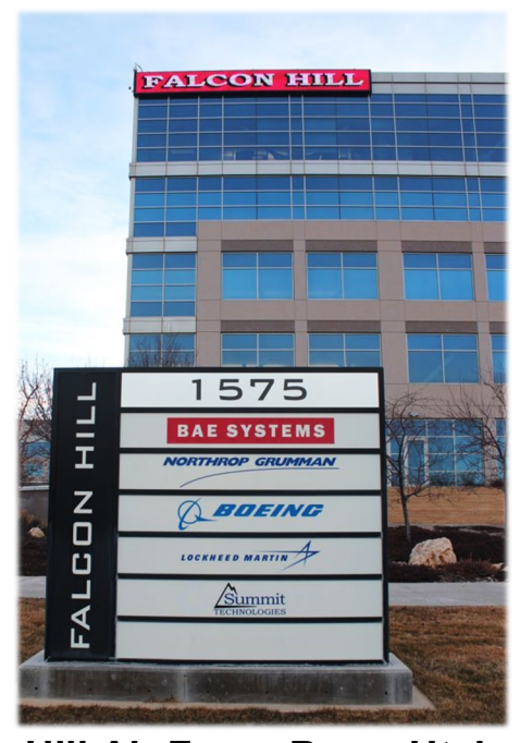
Hill Air Force Base, Utah 6006 Wardleigh Rd, Building 1575 Hill AFB, UT 84056